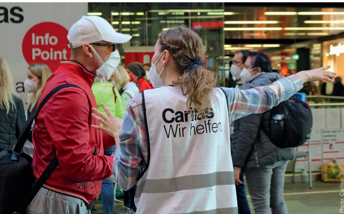
Thousands of volunteers support displaced Ukrainians in Austria.

As Caritas, we are also committed at the political level, primarily to ensure that displaced individuals have unrestricted access to the labor market and are able to work and earn additional income within the basic service system. In 2023, we will continue to emphasize that refugees must have long-term prospects. These include the opportunity to pursue extended education or vocational training and undergo the often time-consuming process of validating foreign qualifications. Moreover, we firmly believe that displaced Ukrainians should be eligible for social assistance.